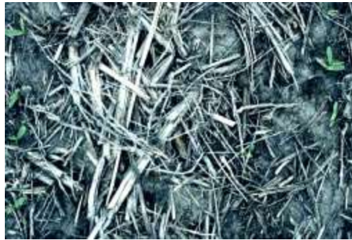
#2 Sb-C-Sb; NT; 76%