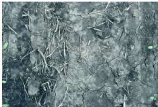
#17 Sb-C-Sb; FC(s); 16%