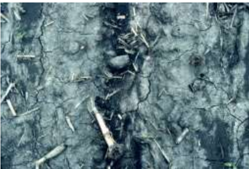
#16 C-Sb-C; VR(f), FC(s); 18%