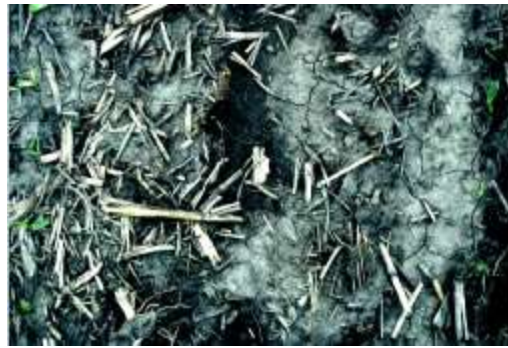
#11 Cont. C; SC(f), CH(f), FC(s); 42%