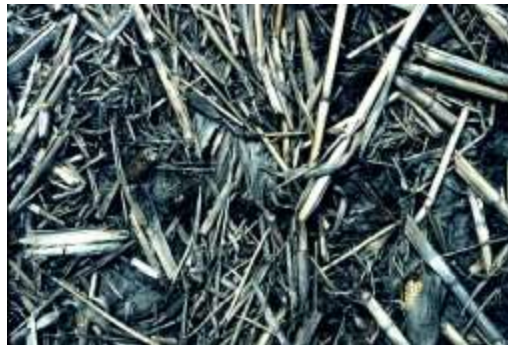
#5 C-Sb-C; NT; 92%