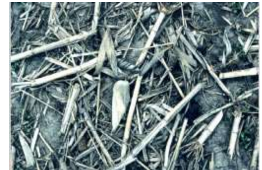
#6 C-Sb-C; NT w/ RC; 72%