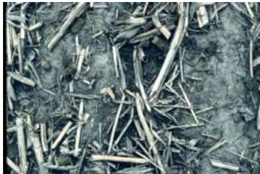
#4 C-Sb-C; CH(f), FC(s); 52%