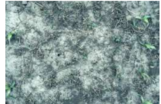
#15 Alfalfa; Clipped and Sprayed (f); 18%