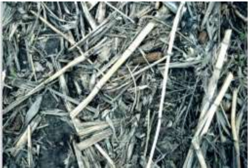
#13 Cont. C; NT; 90%