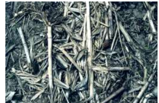
#9 Cont. C; NT w/RC; 86%