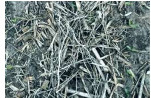
#3 Sb-C-Sb; NT w/RC; 70%