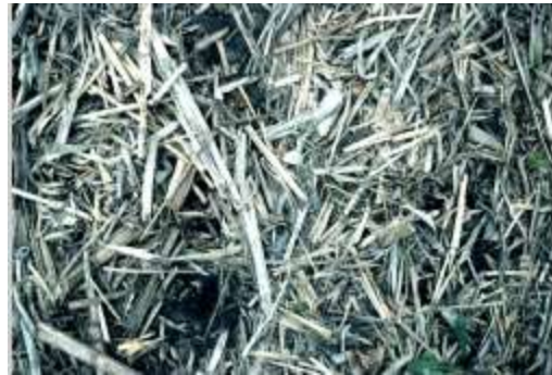
#14 Cont. C; SC(f), NT; 94%