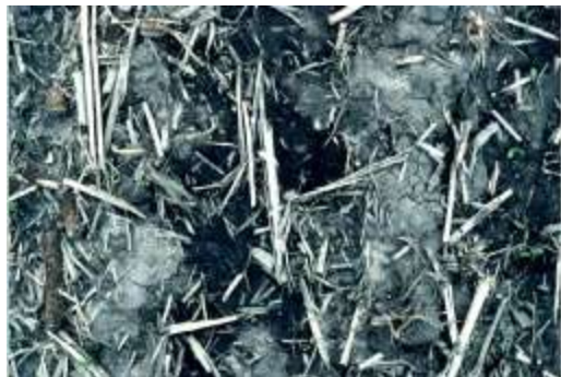
#7 Cont. C; CH(f) FC(s); 36%