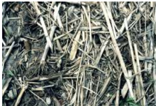
#8 Cont. C; NT; 94%