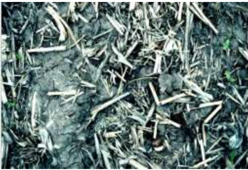
#10 Cont. C; CH(f), FC(s); 56%